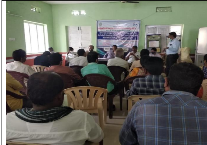
Awarness programme on Micro plan preparation