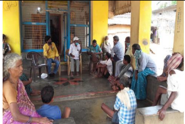
SO TL, CO-ID and CO-SAP are facilitating WUA Meeting