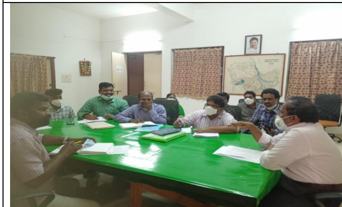
DIU level review meeting by SE,IC Elurur