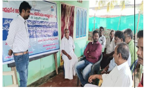
WUA assessment at Yerrampalli

As per the guidelines communicated from the DIU we have completed the WUA self assessment process. After issuing the grade to each WUA we will submit the details grading report to the DIU , Eluru . Fortunately we are dealing with different sections of people in the villages i.e. WUA members, WUA committees, WUA Management Committee, , Washer men, Fishermen, dairy farmers, shepherds and women. Satisfying the needs of different category people under single project is a challengeable task. We have started collection of data from various groups in the tank villages.