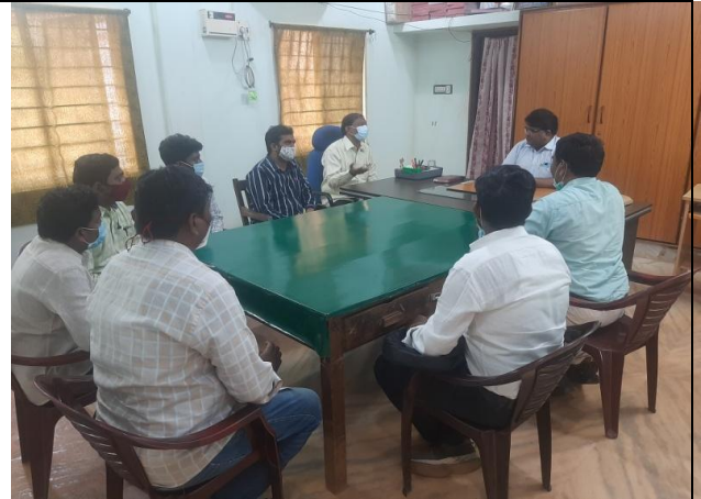
Review meeting with EE ,ID Eluru