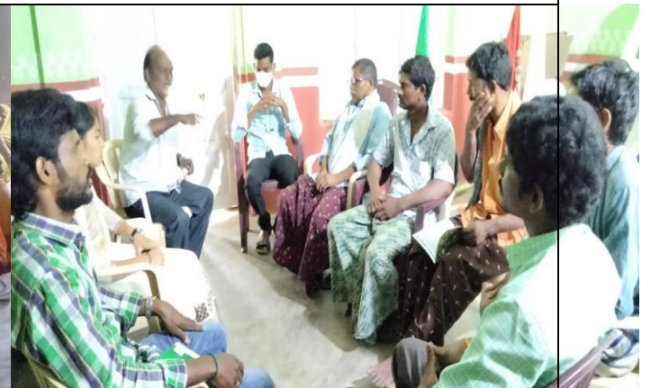
SO Staff Conducted monthly meeting at Uppalapadu