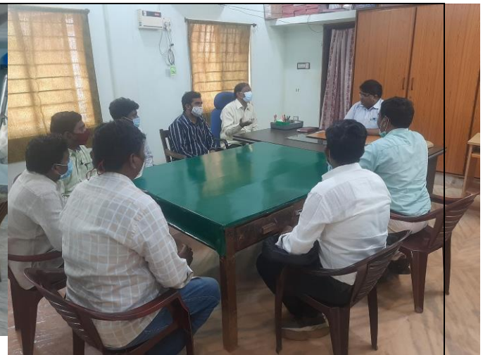
Review meeting with Line Dept at DIU Level