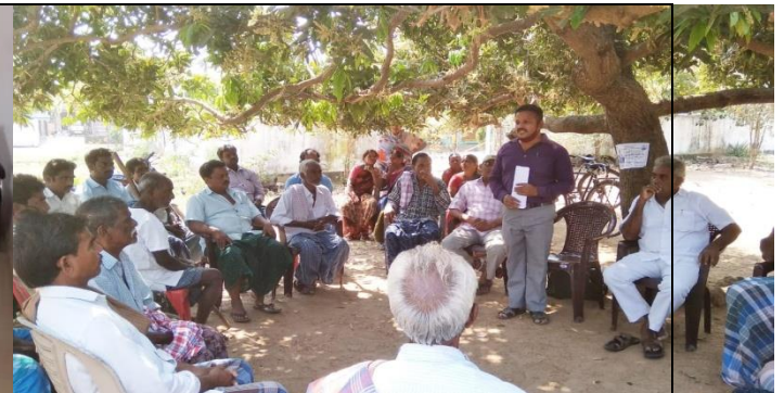
APD-MIS attended monthly meeting at E.L.Puram