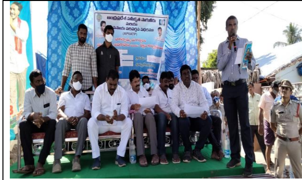
APD-PGM addressing the MLA meeting