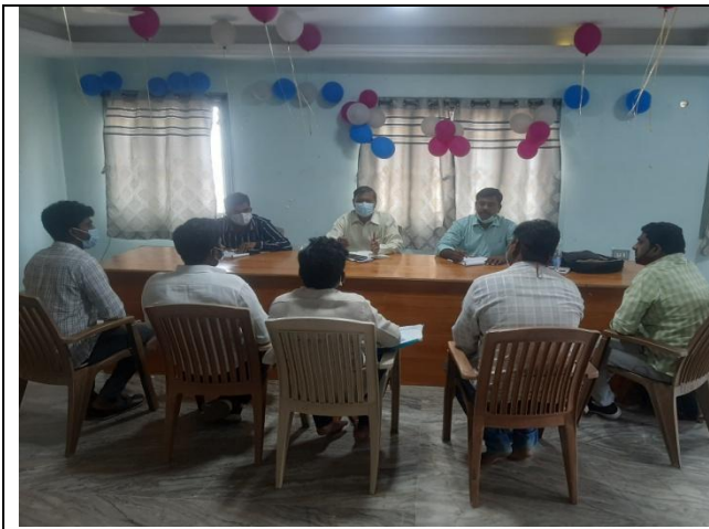
Participate Monthly SO review meeting

We have been conducting regular monthly meetings with our staff before attending the regular monthly meetings with SO staff and convergency meetings with Convener APILIP-II at DIU level. It is mandatory to conduct monthly meetings at SO level where we try to find out the issues at WUA Level related to all the components. During the monthly staff meeting, we do bifurcate the issues to sort out at various levels