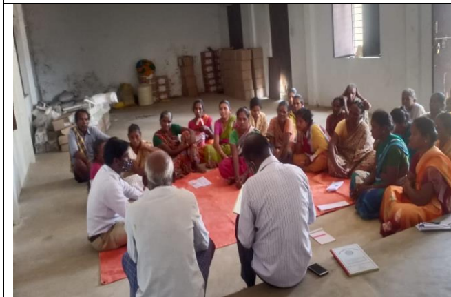
CMS-TL Conducted monthly meeting at Vemulova