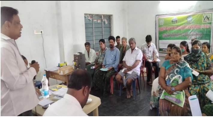
శిక్షణలో మాట్లాడుతున్న APD-ID గారు