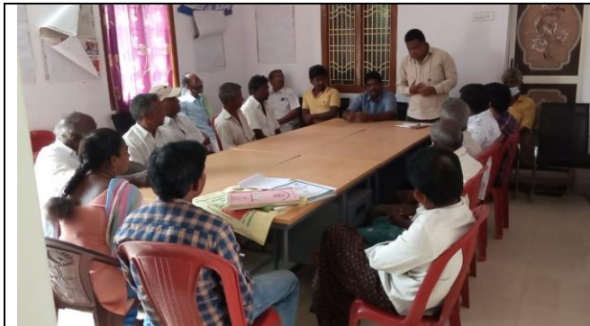
APD-ID attended monthly meeting at Erravaram

Facilitation will be undertaken with the concerned authorities (Revenue, Agriculture and Irrigation) to undertake joint ajmoish with the WUA. The SO should further facilitate the visit by the Revenue Authority to the village for water tax collection and motivate the WUA members to pay water tax in full. WUA should be assisted to maintain data on area irrigated, water tax demand raised and water tax collected. In this year we are conducted all 33 tanks monthly meetings completed regular basis.