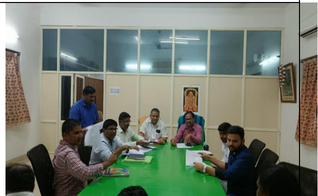
Review on Civil works By SE,IC Eluru