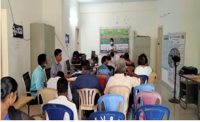
శిక్షణలో మాట్లాడుతున్న APD-ID గారు