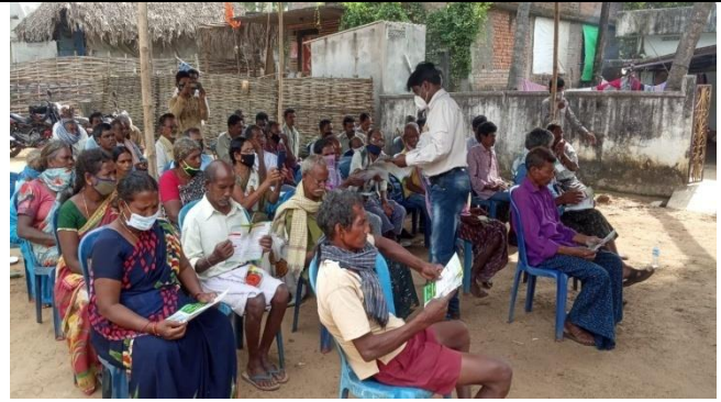
Handout distribution at PGM meeting