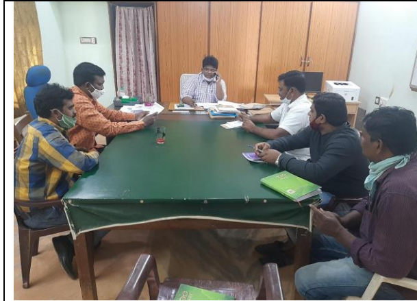
Review meeting DIU Level