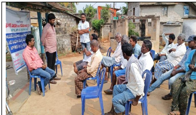
WUA meeting with WUA members

VYAVASAYAKA MARIYU SANGHIKA ABHIVRUDDI SAMSTHA (ASDS) Organization under guidance of SPMU and DIU and in consultation with line departments and WUAs will prepare Micro Plans. SPMU is likely to organize training/workshop on this important subject. After receiving training, the SO will approach line departments like agriculture, Animal husbandry, Fishery, Revenue, Water Resources to provide their plans, programmers' and schemes and guidelines of implementation of their respective activities. After obtaining these inputs for each of the village, in this year 10 villages preparation of Plans conducted April 2021 to January -2022