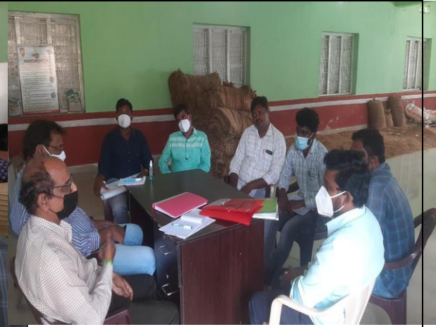
TOT on WUA roles & responsibilities