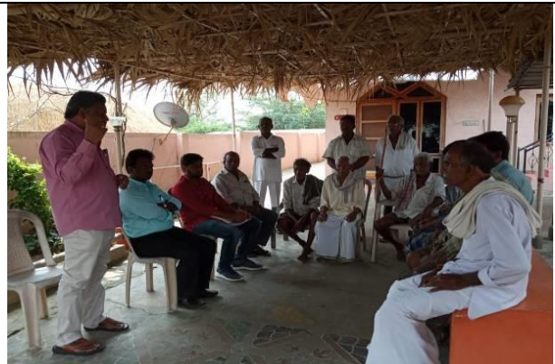
SO Staff conducting WUA self ratings at monthly meetings