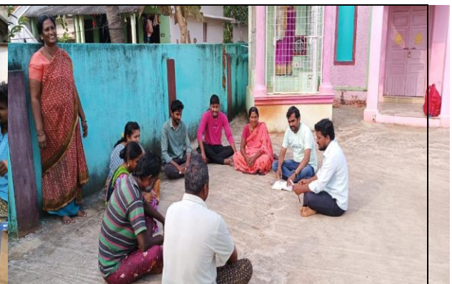
Discuss about FGD on AH Livelihoods at Yerrampalli