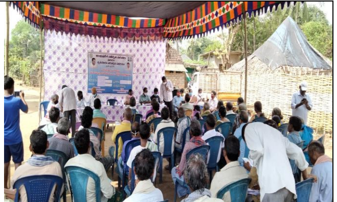
Awareness On PGM at Devaram