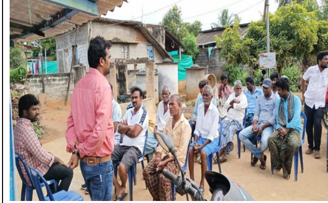
WUA assessment at TCHRPalem