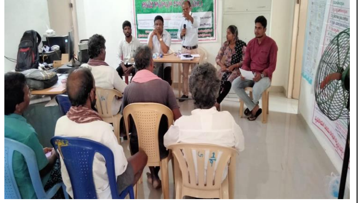
శిక్షణలో మాట్లాడుతున్న AO గారు