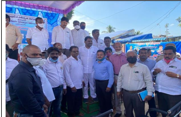
Jaggampeta MLA with Line Departments