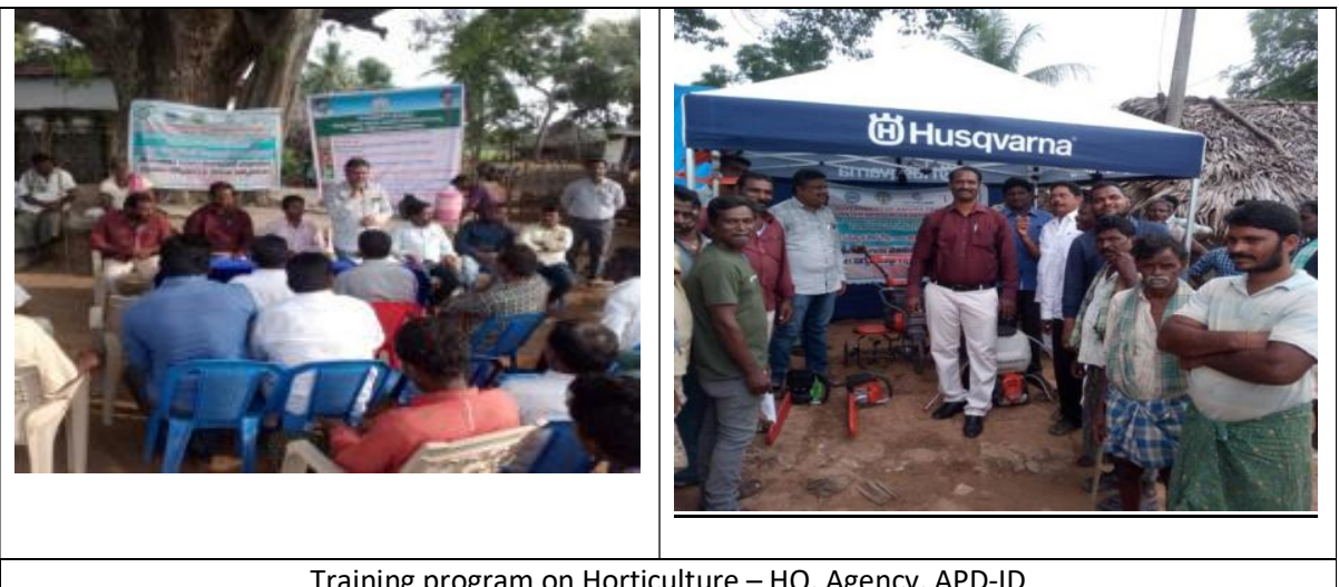
Training program on Horticulture – HO, Agency, APD-ID

In Nellipudi village with support of Horticulture department we organized stall activity and demos , all the farmers participated actively.