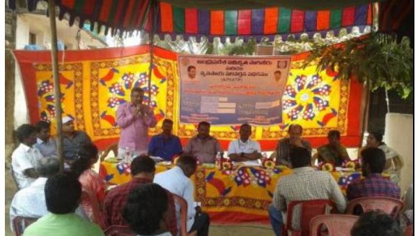
APD-ID is explaining about the need of PGM Activities