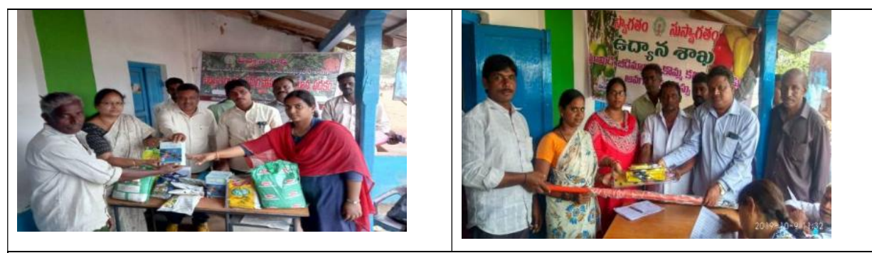
Distributing Inputs to Pedda Tank farmers at Sarabhavaram Village, Prathipadu Mandal

Rejuvenation inputs distributed in 2 villages under Horticulture component (Vemulova & Sarabhavaram) under ADH, Rajamahendravaram .Detailed report and Annexures in Qurterly Prgress Report 2 and 3