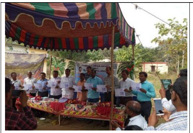
Pamphlet inauguration on PGM Activities