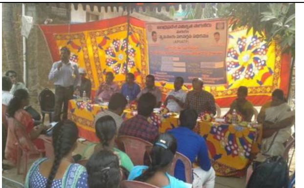
APD-PGM is explaining about PGM Activities