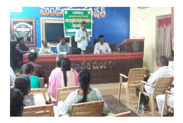
ADA, AOs. AE, and APD-ID