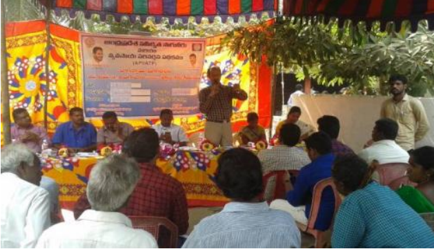
AD-Ground Water is explaining about the Ground Water Interventions in the APIIATP