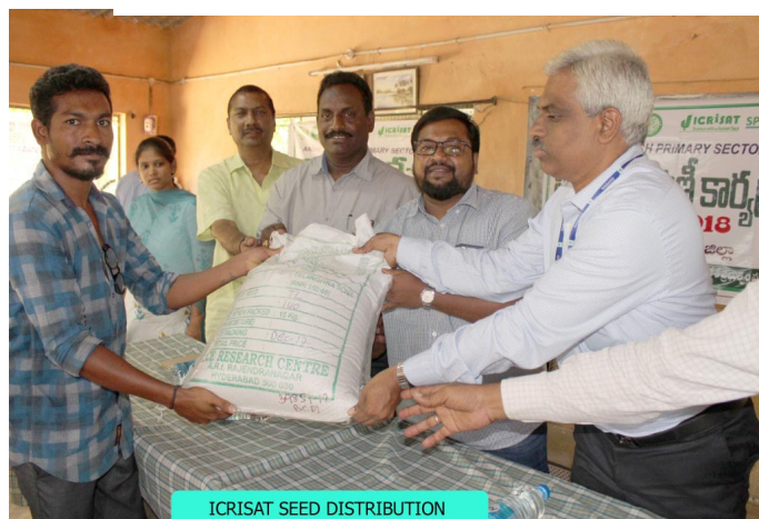
ICRISAT SEED DISTRIBUTION