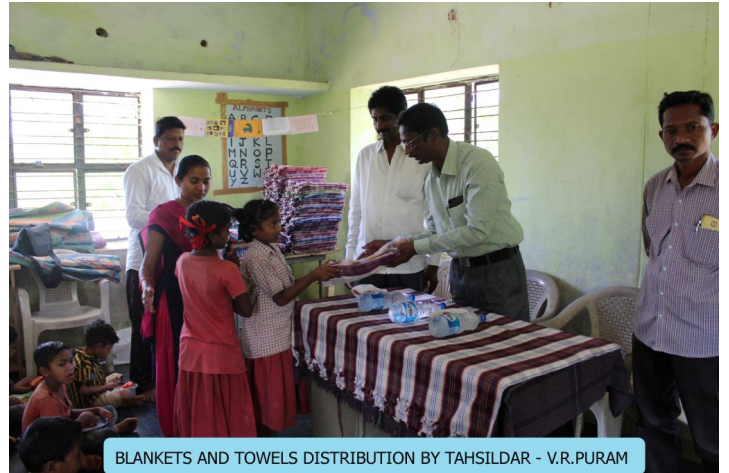
BLANKETS AND TOWELS DISTRIBUTION BY TAHSILDAR - V.R.PURAM