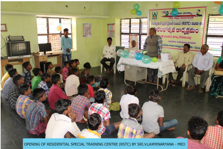
OPENING OF RESIDENTIAL SPECIAL TRAINING CENTRE (RSTC) BY SRI.V.LAXMINARYANA - MEO

Distributed 6,000 note books to GPS and MPPS school children to reduce dropouts lack of primary needs like note books, pens etc., ASDS mobilised these books from ITC – BPL Bhadrachalam and some individual donors.