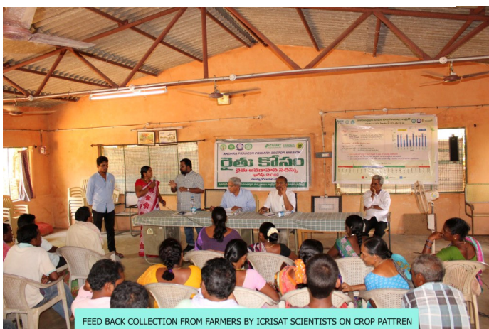
FEED BACK COLLECTION FROM FARMERS BY ICRISAT SCIENTISTS ON CROP PATTREN