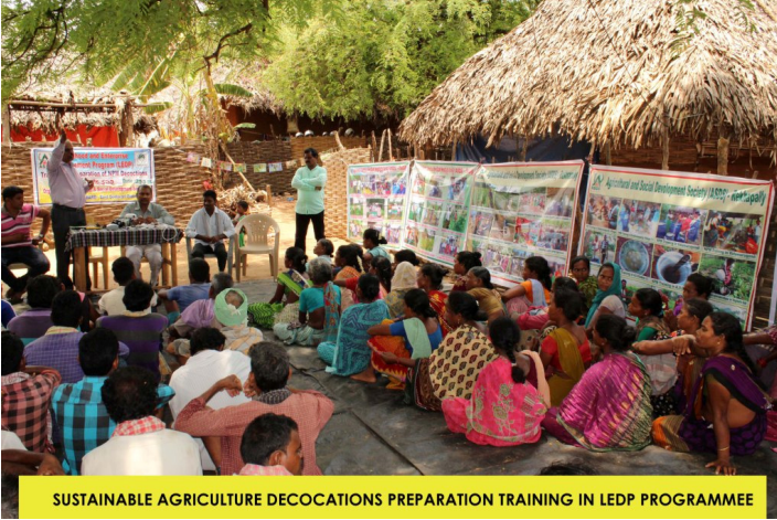
SUSTAINABLE AGRICULTURE DECOCATIONS PREPARATION TRAINING IN LEDP PROGRAMMEE