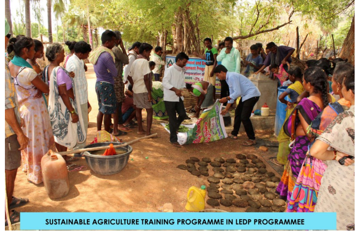
SUSTAINABLE AGRICULTURE TRAINING PROGRAMME IN LEDP PROGRAMMEE