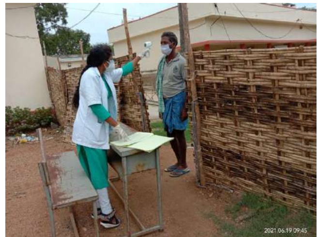
Health checkup by ANM