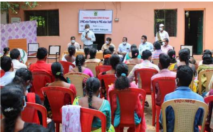
PHC level training on vaccination