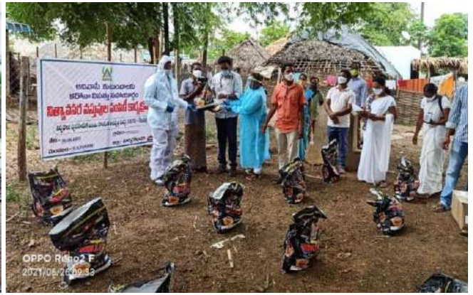
Food Kits distributed to COVID – 19 patients