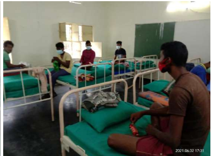
INSIDE VIEW OF CCC