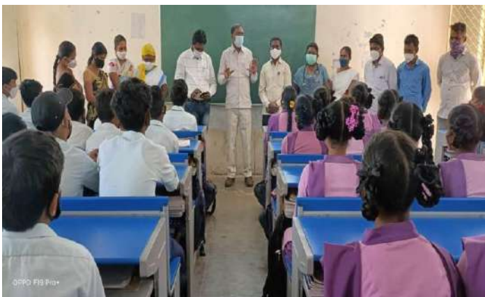
Awareness and vaccination to school children