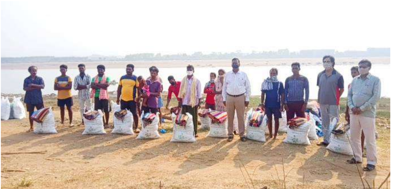
Distribution of food kits to Fire victims