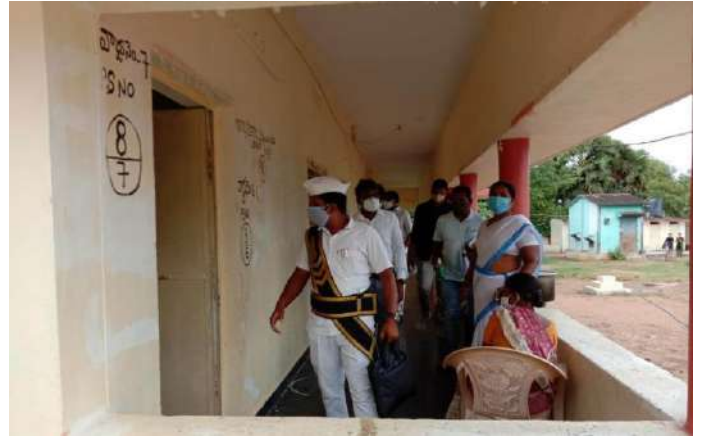
Chintur ITDA PO Visited CCC