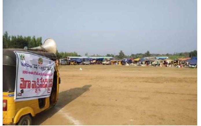
Awareness through mass canvassing on COVID – 19 Vaccination