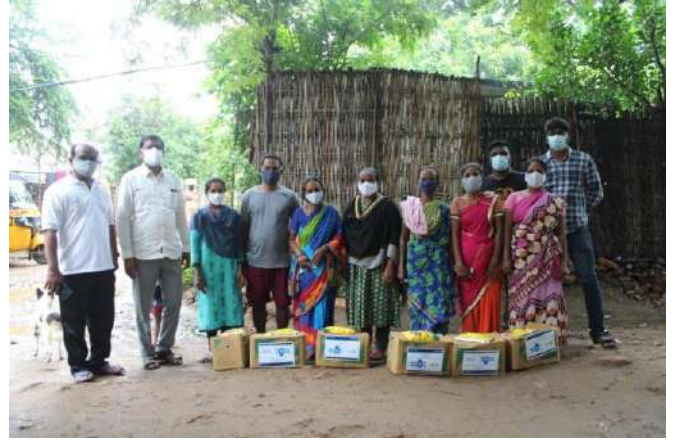
Distribution of food kits to flood victims