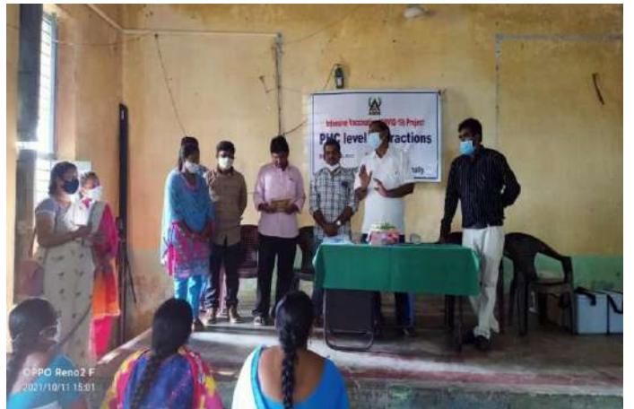
G.P. level Awareness meetings on COVID Vaccination