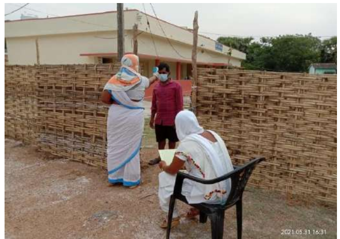
HEALTH CHECKUPS BY MEDICAL TEAM