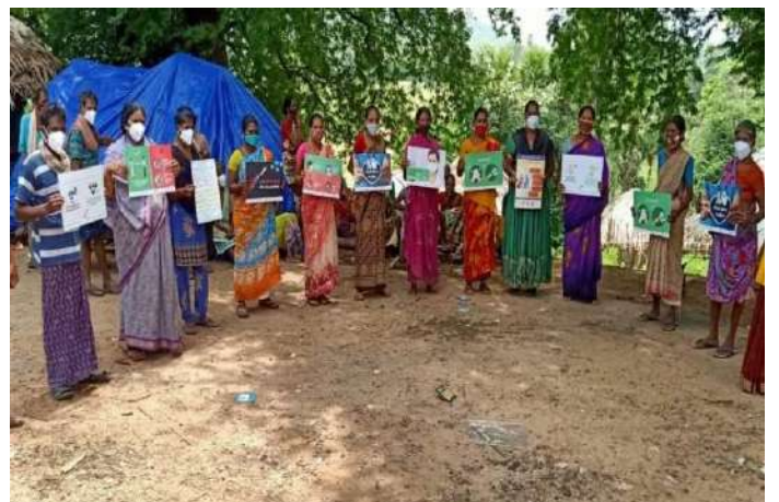
Awareness through Flexes and Posters on COVID - 19