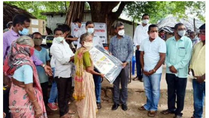
Distribution of Tarpaulin Sheet