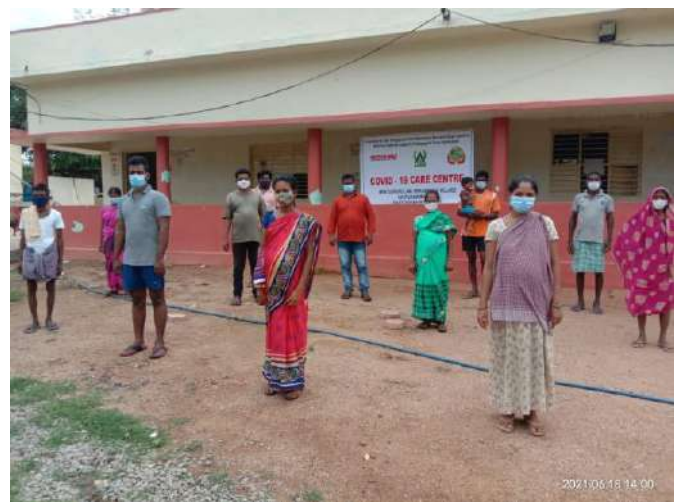
Buckets, Tooth Paste, Mugs, Soaps Etc., distribution to Patients