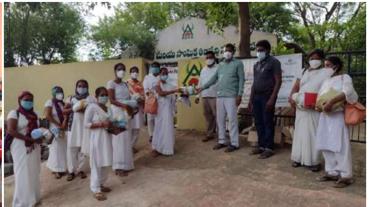
Medical kits Distributed to Health Workers