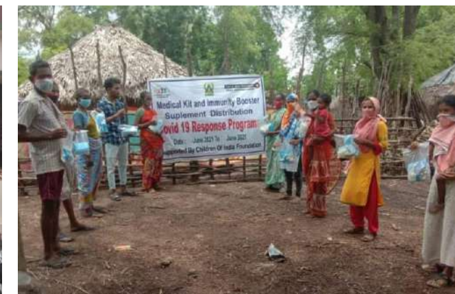
COVID Home Care kits distributed to COVID patients and Front line workers