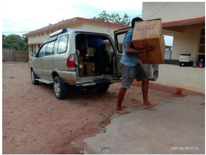
MATERIL FROM OF COVID CARE CENTRE